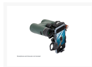
Smartphone and Celestron not included